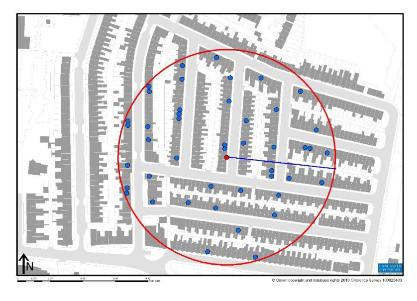
Figure 1 - Houses – identifying the 100m radius around the application property

(Figure 1 is indicative and does not identify actual HMOs)